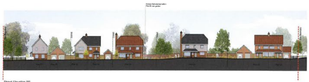
Street Elevation BB