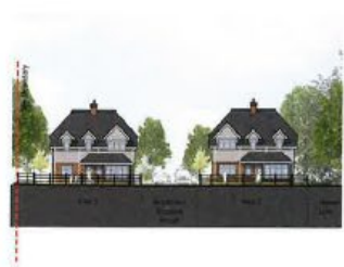
Street Elevation EE