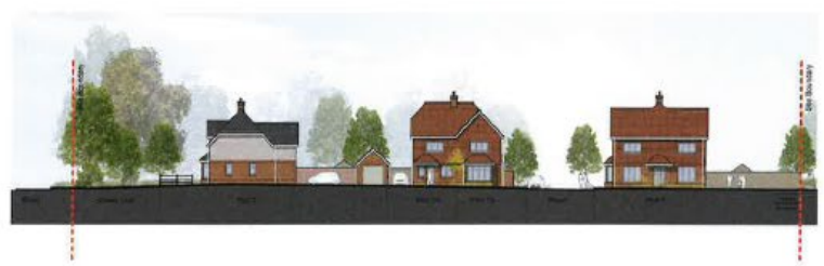
Street Elevation DD