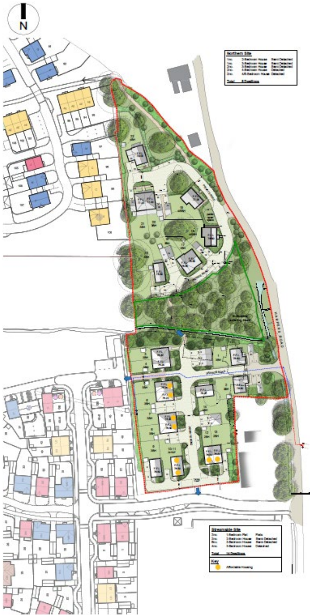
Consented Appeal Block Plan