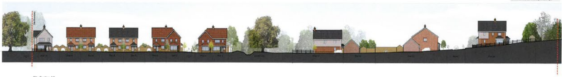
Site Section AA

The information on this page is for informational purposes only. It is not intended to be used as a contract or any other legal document.