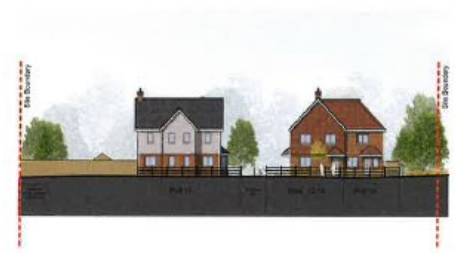
Street Elevation CC