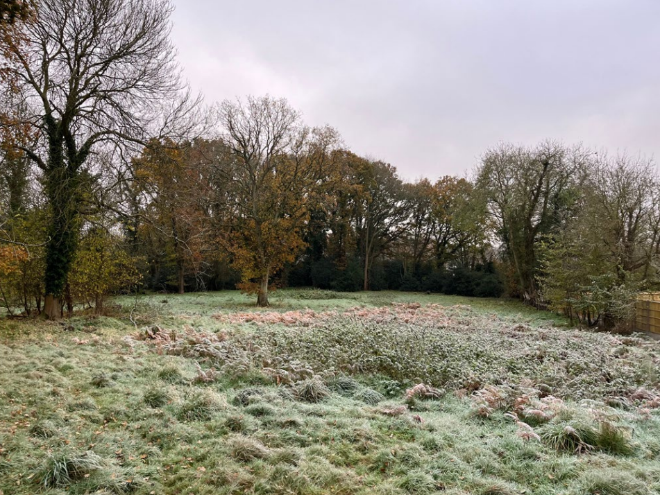
Northern Half of Site