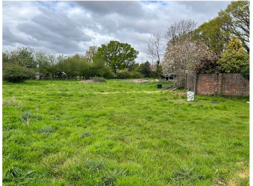
Existing Dwelling and Southern Half of Site